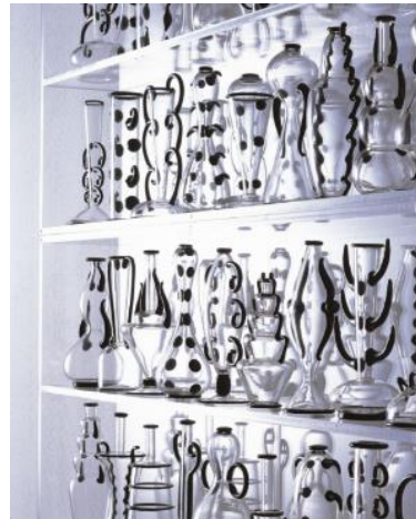
5. Dante MARIONI, Vessel Display , 2010