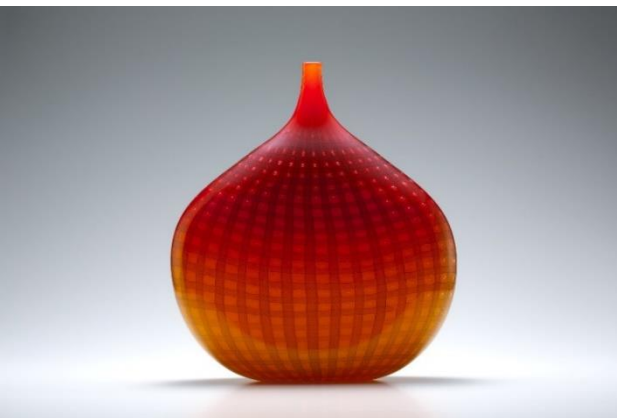
6. YASUDA Taizo, Lace vase , 2006