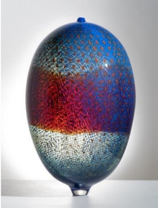
1. Lino TAGLIAPIETRA, Africa , 2014