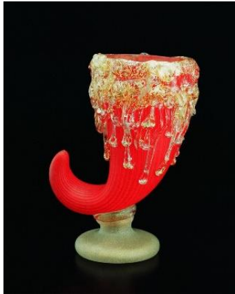
2. FUJITA Kyohei, Vase , 2000