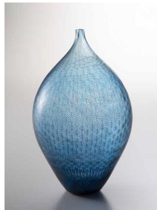
7. ENAMI Fujiko, Water , 2014

All of the works listed above are collection of Toyama Glass Art Museum.