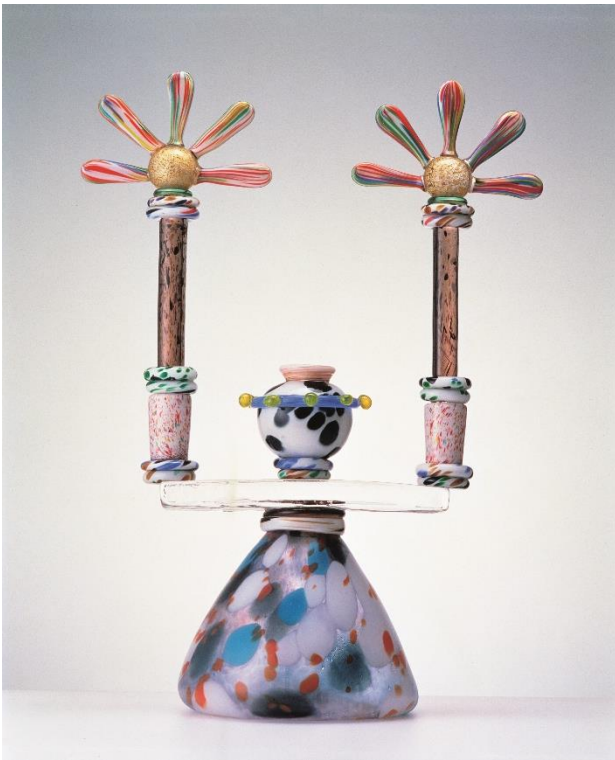
2. YOKOYAMA Naoto, Flower Guard , 1988 Collection of Suntory Museum of Art