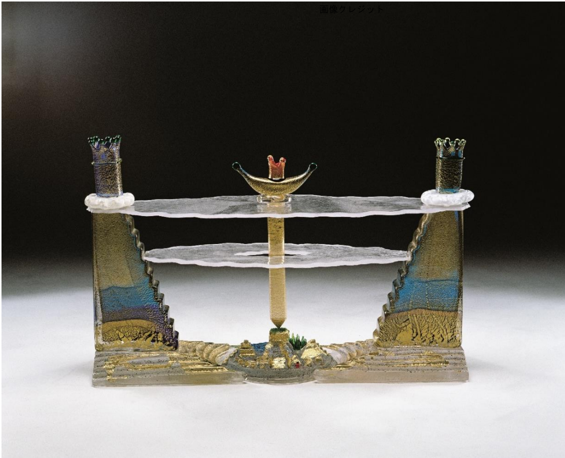
1. MURO Shinichi, ARK... , 1990, Collection of Suntory Museum of Art, Photo by KOJIMA Hirokazu, SAIKI Taku