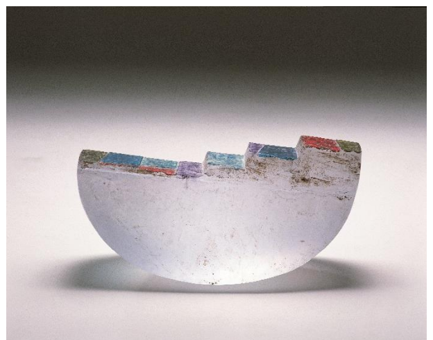
5. OHGITA Katsuya, BALANCE , 1994 Collection of Suntory Museum of Art