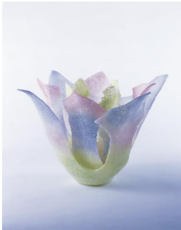
1. NISHI Etsuko, Charming Lady , 2013, Photo: SAIKI Taku