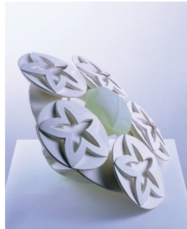
3. TASHIMA Etsuko, Cornucopia 99-X , 1999, Photo: SAIKI Taku