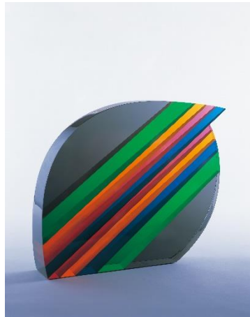
2. Pavel HLAVA, Leaf Colourful , 1998, Photo: SAIKI Taku