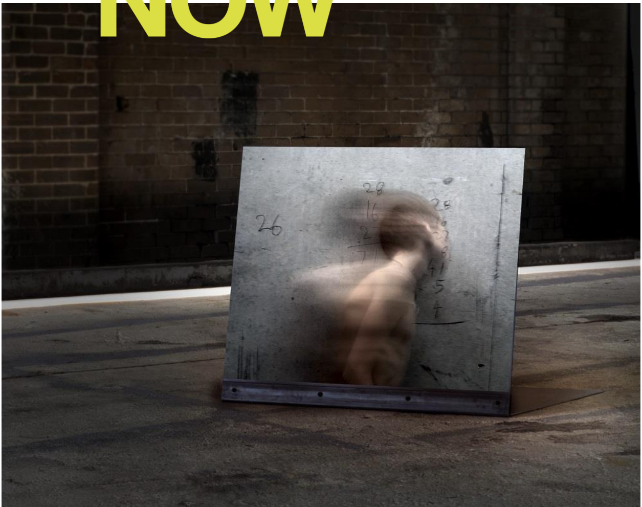
1 Kate Baker, Sculpture/ Within Matter #2 , 2018, CMoG 2019.6.6.