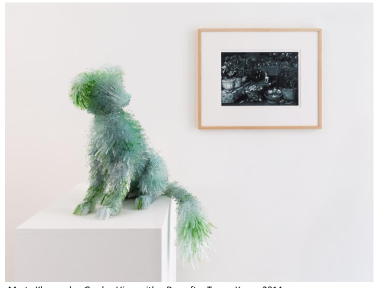
Marta Klonowska, Garden View with a Dog after Tomas Yepes , 2014 Toyama Glass Art Museum, Courtesy: lorch+seidel, Photo: Eric Tschernow

2019.4.27<sub>SAT</sub>-9.23<sub>MON</sub>