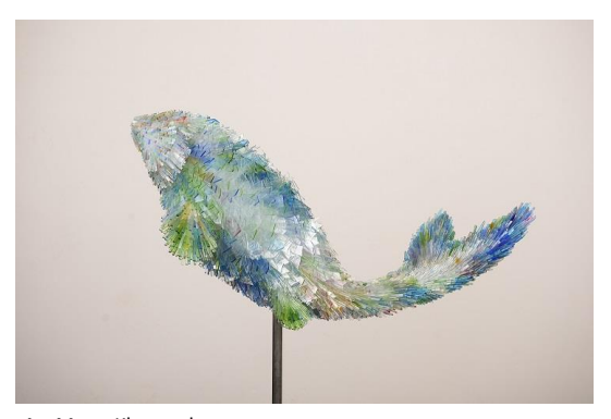
4 Marta Klonowska Carp after Hiroshige Utagawa 2018 Irene Burnstein Collection