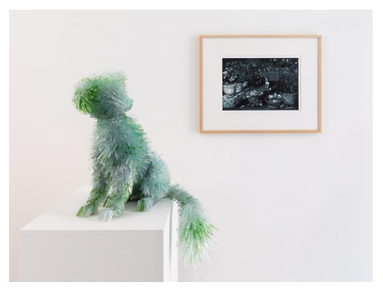
1 Marta Klonowska Garden View with a Dog after Tomas Yepes 2014 Toyama Glass Art Museum