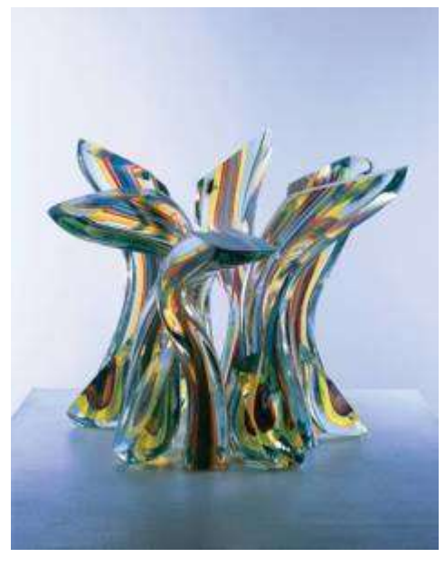
4. Harvey K. LITTLETON, Yellow Crown II , 1984

Here we introduce works that, through layering, present a variety of color effects, with glass of other colors placed on the glass foundation or other materials layered on it. Transparent glass transmits to the outside the layers of colors shut within it, showing it to us. Moreover, combining glass and metallic leaf or other non-glass materials makes it possible to create distinctive colors and textures. Please note, as you enjoy these works, the profound colors, the color variations, and the three-dimensional color compositions that layering makes possible.