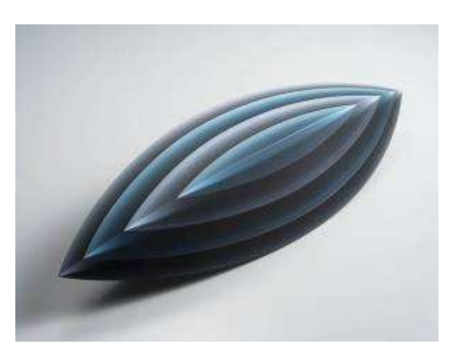
8. KOJIMA Yukako, Layers of Light -Night-, 2011

All of the works listed above are collection of Toyama Glass Art Museum.