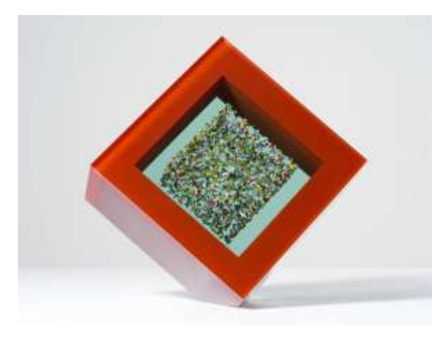
2. Bohumil ELIÁŠ, Microworld //, 2003