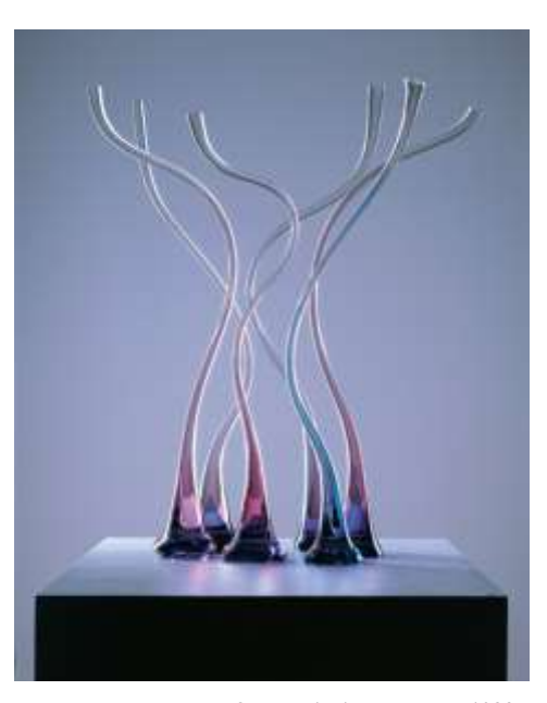
5. Harvey K. LITTLETON, Implied Movements , 1988