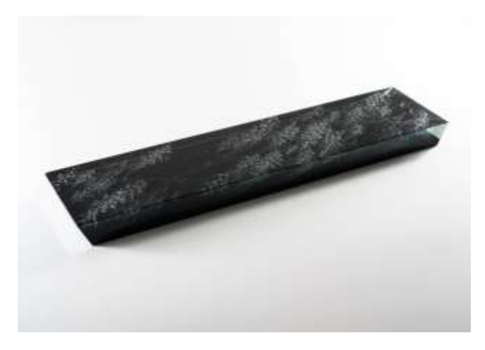
1. WATANABE Chiemi, A light of the clear stream , 2018

Stacking multiple layers of transparent sheet glass can show the layering of pictures and motifs drawn on them. A single piece of sheet glass is flat, but layering those sheets makes motifs appear in a three-dimensional manner and at times makes us sense a depth in the glass that is deeper than reality. Here we focus on the three-dimensional effects produced within a work by layering flat surfaces. Please enjoy their intriguing effects, which seem to intermingle two and three dimensions.