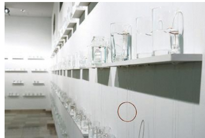
AKAMATSU Nelo, Chijikinkutsu , 2013, Collection of the artist, ©AKAMATSU Nelo Installation view: OK Center for Contemporary Art [Linz, Austria]

Sound, light and the passing of time sensed in randomly encountered scenes can summon up our own sensations and memories, the experience producing an unexpected connection between us, and the scene before our eyes. This exhibition features three artists whose installations act on the senses and memories of the viewer to encourage active engagement with the realm of their creation.