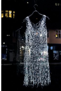
GONJO Mafune, Scent of mist , 2017 Collection of the artist.

“Microcosmos” explores new aspects of glass and expression via works by seven currently active artists. Delve into the microcosmic realms of complex, delicate pieces constructed by these artists as they identify strength and beauty in that different to themselves, whether it be familiar flora and fauna, or materials used in their art.