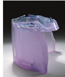
SHIBUYA Ryoji, Memory of Time '90-V , 1990 Collection of Suntory Museum of Art

After emerging in the mid-20th century, contemporary glass art flourished internationally in the 1980s and '90s. This exhibition will feature contemporary glass artworks from the Suntory Museum of Art, which boasts one of Japan's foremost glass art collections, and from the collection of the Toyama City. Through the works, the exhibition will show the creative vitality that characterized glass art in the eighties and nineties. Viewers will be inspired by the artists' tireless passion for investigating their material, seeking glass's potential for individual sculptural expression.