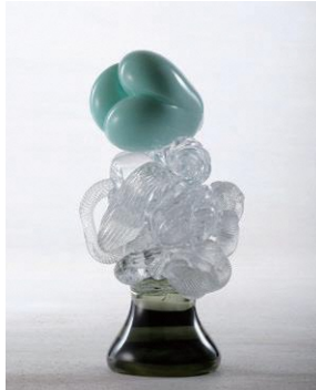
TAKAHASHI Yoshihiko, enigma , 2019 Collection of the artist

Takahashi Yoshihiko (b. 1958) produces works using a variety of methods, based on properties and textures of glass intuited in his practice. In his hot work especially, smooth surfaces and flexible forms capitalizing on the motion of melted glass make for pieces of enigmatic appeal that in their sheer tactility inspire the viewer to flights of fancy. This exhibition takes a close up look at the fascinating work of an artist eminently skilled at coaxing out the myriad aspects of glass.