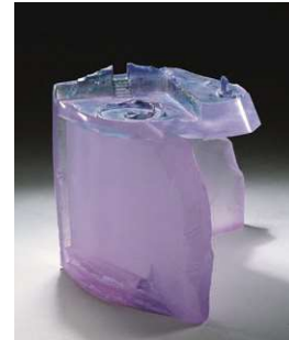
SHIBUYA Ryoji, Memory of Time '90-V , 1990 Collection of Suntory Museum of Art, Photo by KOJIMA Hirokazu, SAIKI Taku

After emerging in the mid-20th century, contemporary glass art flourished internationally in the 1980s and '90s. This exhibition will feature contemporary glass artworks from the Suntory Museum of Art, which boasts one of Japan's foremost glass art collections, and from the collection of the Toyama City. Through the works, the exhibition will show the creative vitality that characterized glass art in the eighties and nineties. Viewers will be inspired by the artists' tireless passion for investigating their material, seeking glass's potential for individual sculptural expression.