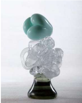
TAKAHASHI Yoshihiko, enigma , 2019 Collection of the artist, Photo by SAIKI Taku

Takahashi Yoshihiko (b. 1958) produces works using a variety of methods, based on properties and textures of glass intuited in his practice. In his hot work especially, smooth surfaces and flexible forms capitalizing on the motion of melted glass make for pieces of enigmatic appeal that in their sheer tactility inspire the viewer to flights of fancy. This exhibition takes a close up look at the fascinating work of an artist eminently skilled at coaxing out the myriad aspects of glass.