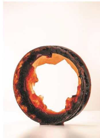
4. Aleš Vašíček, Nukleus , 1997