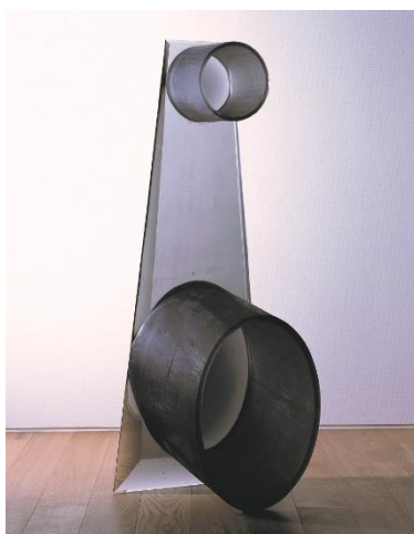
5. Jiří Nekovář, Baroque Guard II , 2002, Photo by SAIKI Taku