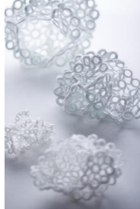
14. ITO Machiko, Symbiosis , 2021, collection of the artist