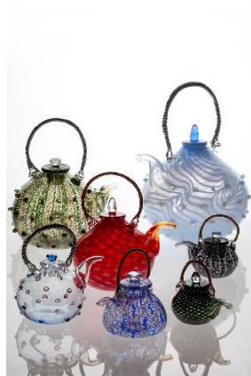
4. KONISHI Ushio, Kettle Solar System , 2021, collection of the artist