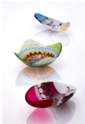
1. TSUKURIMICHI Ryoko, Chronicles of the People , 2021, collection of the artist