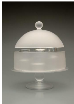
5. Boyd SUGIKI, Untitled , 2021, collection of the artist