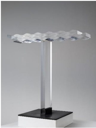
10. Vladimír KLEIN, Horizontal of the sea , 1995, collection of Toyama Glass Art Museum