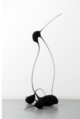
13. KOBAYASHI Chisa, Black / White 2021-1 , 2021, collection of the artist