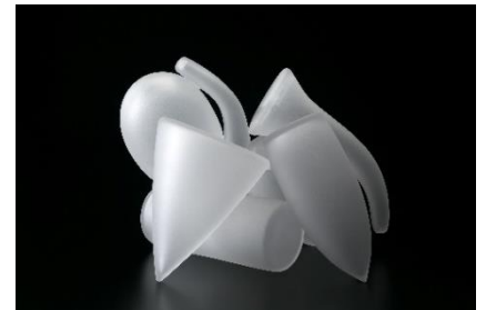
3. Jack Wax, Breath , 1994, collection of Toyama Glass Art Museum