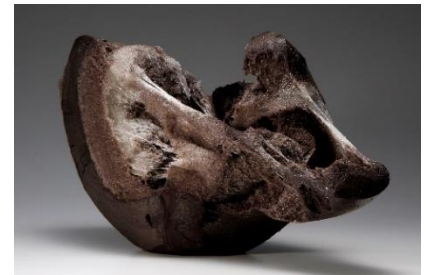
15. TSUMORI Hidenori, Oscillation '19-4 , 2019, collection of the artist