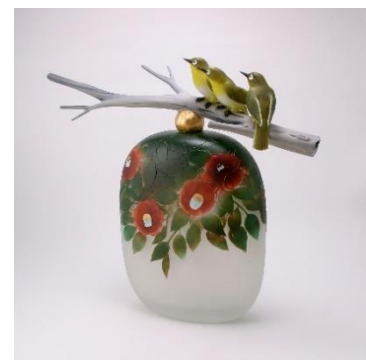
12. KOBAYASHI Toshikazu, "Spring in the Air" White-eyes and Camellia , 2008, collection of the artist