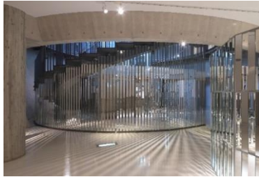
7. HONGO Jin, Merging Boundaries , 2021, collection of the artist (installation view of "HONGO Jin Landscape Expanders" Notojima Glass Art Museum, 2021)