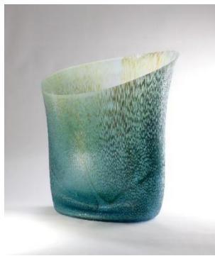
11. TSUKADA Midori, Natural Verse , 2019, collection of the artist