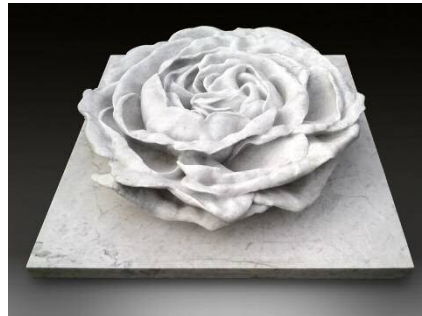
4. White Rose , 2017, Collection of the Artist