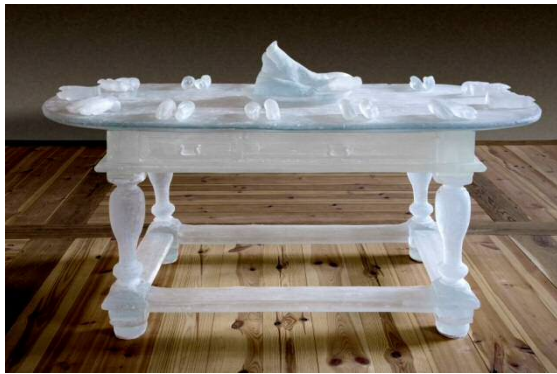
1. Feast-table , 2013, Collection of the Artist