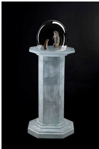
3. David and Goliath, 2015, Collection of the Artist