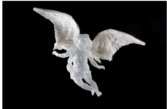
2. Between Heaven and Earth , 2015, Collection of the Artist