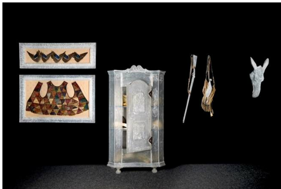
6. My Dear; Hunter from Lavondyss , 2009, Collection of the Artist