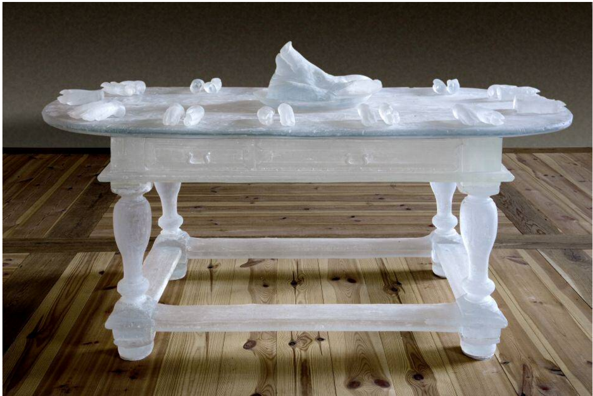
Feast-table , 2013, Collection of the Artist