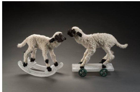
7. Rock and Roll Shaun the Sheep , 2018, Collection of the Artist