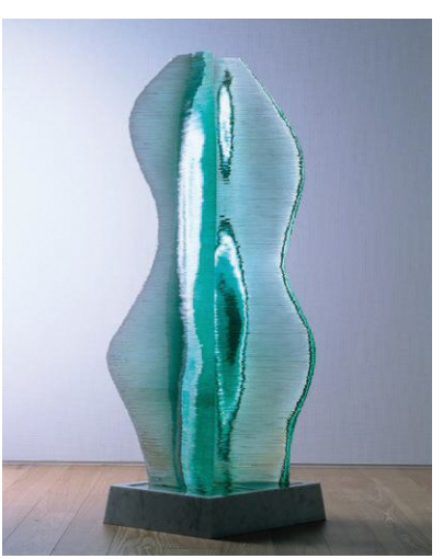
IKUTA Niyoko, Swing - 40, 1991, Toyama Glass Art Museum, Photo by SAIKI Taku

Since the mid-1970s there has been a growing trend in Japan for artists to undertake their own glass making. Through the 1980s and '90s—years of flourishing international exchange, many new educational institutions, and a stream of open-call exhibitions—and up to the present, the result has been a magnificent flowering of expression. Taking the opportunity afforded by this exhibition to showcase 50 years of contemporary Japanese glass art history, including very recent work, we examine the allure, and the boundless possibilities, of expression evolving out of the choice of glass as a material.