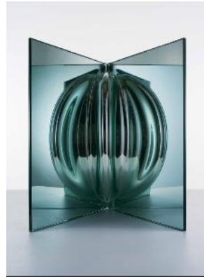
2. ABIRU Shogo, K 08 F , 2008