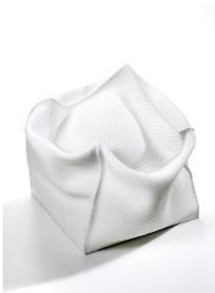
5. FIJIKAKE Sachi, Vestige , 2018