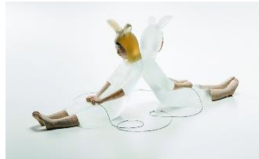
4. ODAHASHI Masayo, The Heart in Balance-Link- , 2011