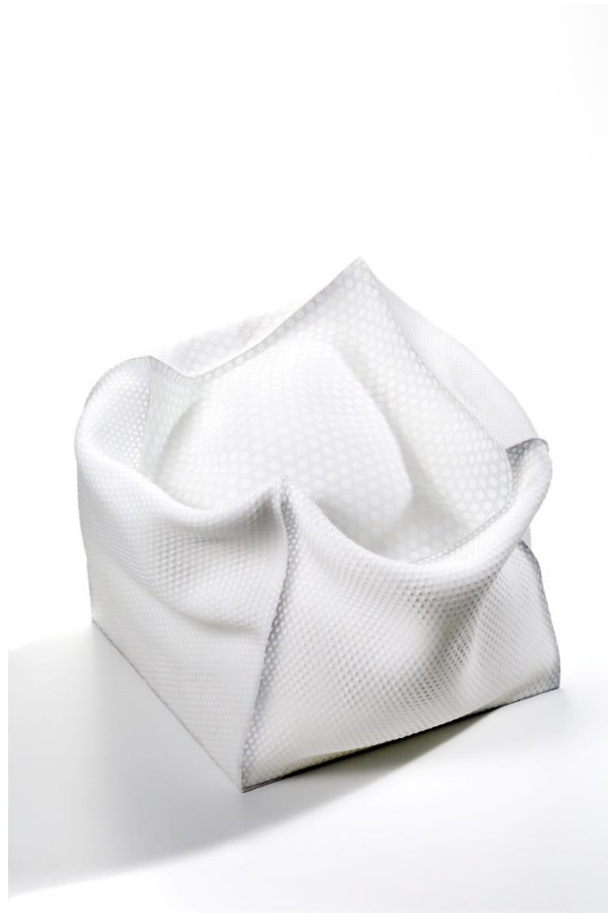
FIJIKAKE Sachi, Vestige , 2018

■ Title : Collection Exhibition Towards the Toyama International Glass Exhibition