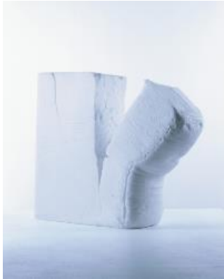
1. KOJIRO Yoshiaki, A return #7 , 2004