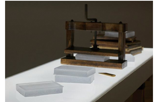
MIYANAGA Aiko, Strata , 2018-19 ©MIYANAGA Aiko, Courtesy of Mizuma Art Gallery, Photography by KIOKU Keizo

This exhibition has given Miyanaga time to engage with glass in earnest, resulting new work that unpacks every aspect of this alluring material, with a special Toyama twist. Going by the artist's past form, the subtle, pervasive warmth underlying this latest offering will help to brush away the cobwebs and offer a new clarity of vision for all.