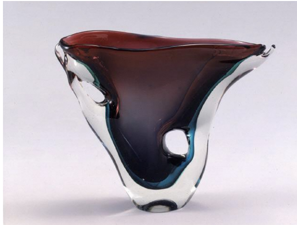
IWATA Toshichi, Vase , 1960 Collection of Shinjuku Historical Museum

The Taisho and early Showa years saw the emergence of Japanese artists authentically engaged in glass production as a means of self-expression. After the war, amid the large cohort of designers employed by glass companies, there was also a gradual increase in independent glass art production. Taking a fresh look at the evolution of modern Japanese glass expression from its beginnings, this comprehensive exhibition will showcase the creative genius of artists with an unbridled passion for their material who carved out new and exciting territory in the realm of glass art.