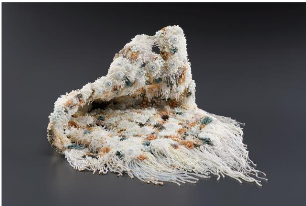
4. KINOSHITA Yui, Resuscitation , 2020, Rakusui-tei Museum of Art