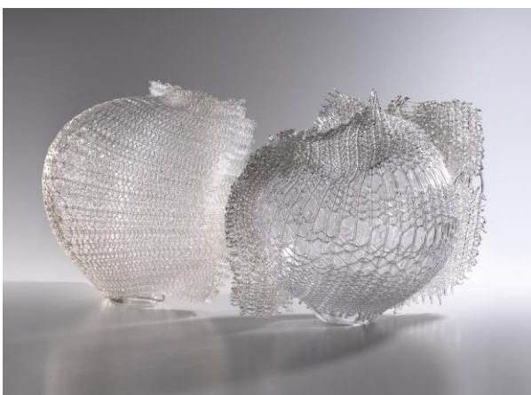
6. TAKEOKA Kensuke, Line Transition '21 , 2021, Toyama Glass Art Museum