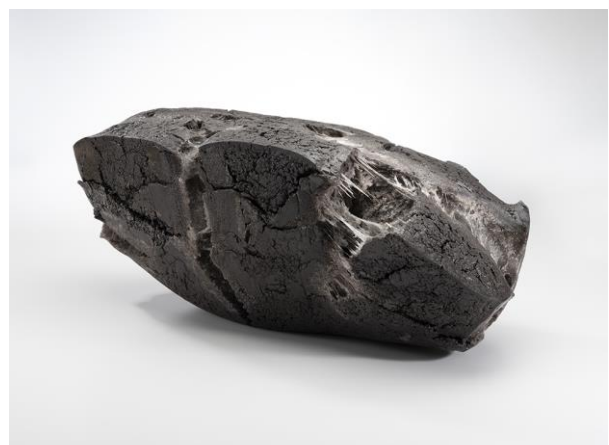
7. TSUMORI Hidenori, Oscillation '17-4 , 2017, Toyama Glass Art Museum, Photo by SUEMASA Mareo