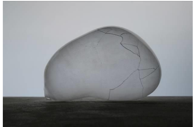
3. UEMURA Hiroki, Tracing the Breath , 2021, Collection of the artist