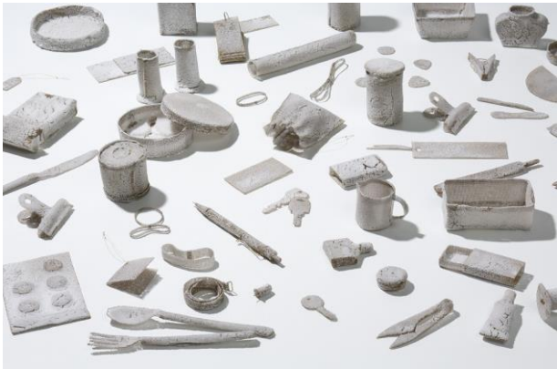
2. IMAI Ruiko, Reminiscence , 2016-, Collection of the artist