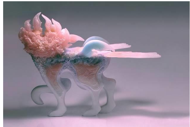
5. TAKAHASHI Makiko, Share the Sign , 2020, Collection of the artist