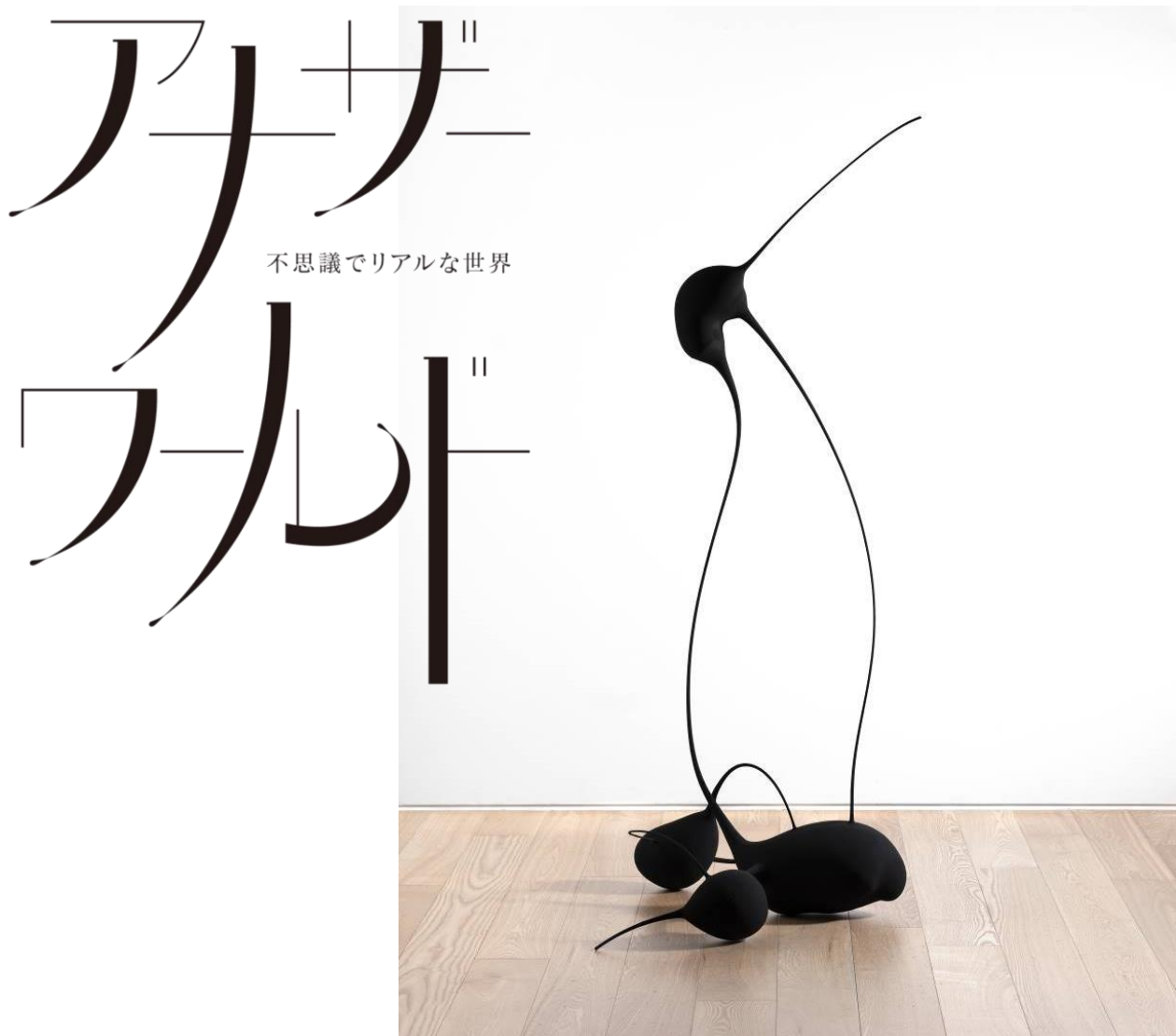
1. KOBAYASHI Chisa, The Form of Black; The Form of White 2021-1 , 2021, Toyama Glass Art Museum