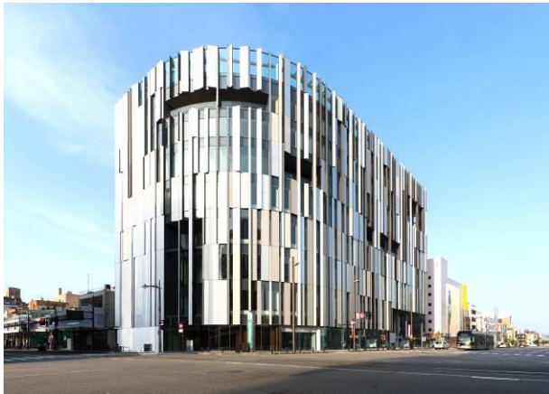
11. Toyama Glass Art Museum Exterior