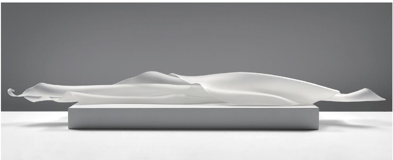
What remains , 2019. Collection of the artist.

Kirstie Rea: The Breadth of Stillness , the Australian artist's first solo exhibition in Japan.