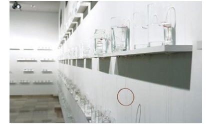
AKAMATSU Nelo, Chijikinkutsu , 2013, Collection of the artist, ©AKAMATSU Nelo Installation view: OK Center for Contemporary Art [Linz, Austria]

Sound, light and the passing of time sensed in randomly encountered scenes can summon up our own sensations and memories, the experience producing an unexpected connection between us, and the scene before our eyes. This exhibition features three artists whose installations act on the senses and memories of the viewer to encourage active engagement with the realm of their creation.