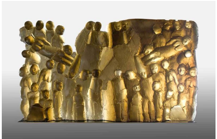
4. River , 2011 Collection of Wolff & Co, Sweden