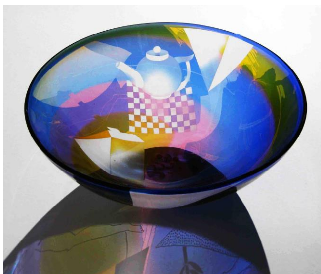
2. Bowl at Home, 1982 Collection of Ann Wolff Foundation, Gotland, Sweden