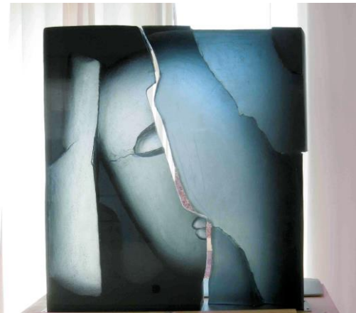
5. Blues , 2011 Collection of Wolff & Co, Sweden