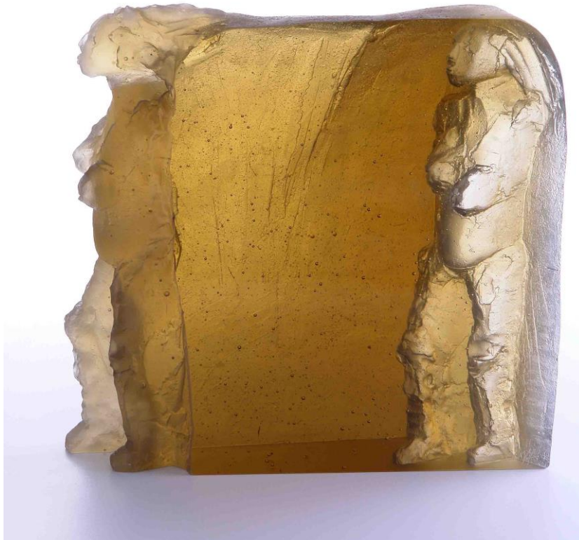
1. Andante , 2005, Collection of Ann Wolff Foundation, Gotland, Sweden