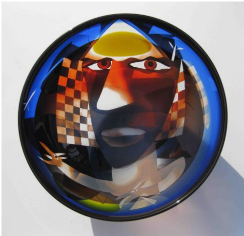
3. Goddess as Witch , 1985 Collection of Ann Wolff Foundation, Gotland, Sweden