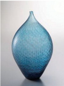
ENAMI Fujiko, Water , 2014 Collection of Toyama Glass Art Museum