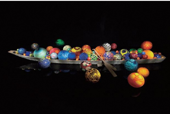
Dale CHIHULY, Toyama Float Boat , 2015 H60xW917.5xD657.5cm, Toyama Glass Art Museum ©Chihuly Studio. All Rights Reserved.

This exhibition presents five installations by Dale Chihuly, a contemporary glass maestro. These installations, among Chihuly's signature series, can only be seen in Toyama.