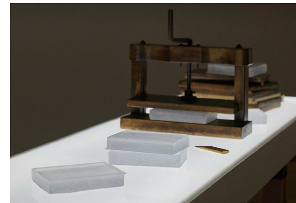
MIYANAGA Aiko, Strata , 2018-19 ©MIYANAGA Aiko, Courtesy of Mizuma Art Gallery, Photography by KIOKU Keizo

This exhibition has given Miyanaga time to engage with glass in earnest, resulting new work that unpacks every aspect of this alluring material, with a special Toyama twist. Going by the artist's past form, the subtle, pervasive warmth underlying this latest offering will help to brush away the cobwebs and offer a new clarity of vision for all.