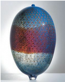
Lino TAGLIAPIETRA, Africa , 2014 Collection of Toyama Glass Art Museum

We exhibit contemporary glass artworks in the collection of Toyama Glass Art Museum. Gathered here are groups of works that appear to be responding to changes in the world and new values created one after another.