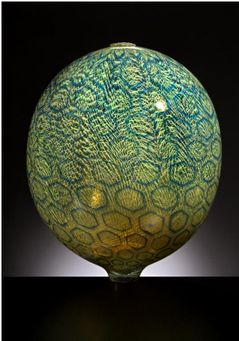
4. Lino Tagliapietra, Africa 2015, Lino Tagliapietra Collection