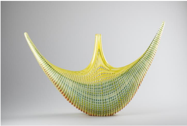
6. Lino Tagliapietra, Batman 2006, Lino Tagliapietra Collection