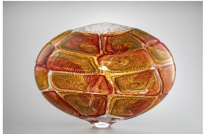
7. Lino Tagliapietra, Kira 2010, Lino Tagliapietra Collection