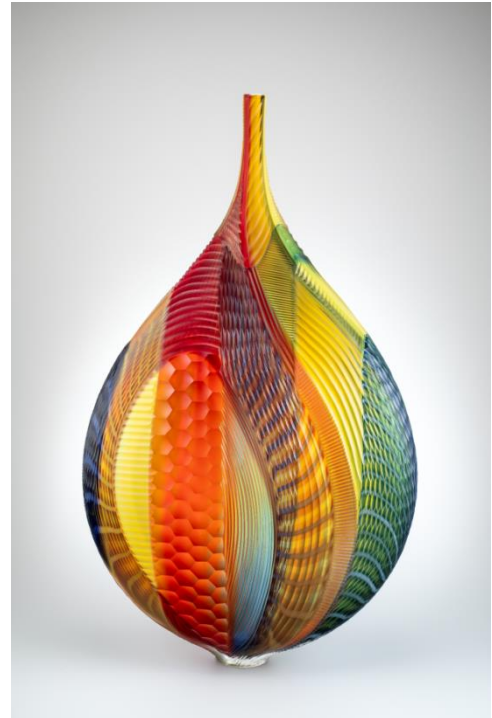
9. Lino Tagliapietra, Mandara 2005, Lino Tagliapietra Collection