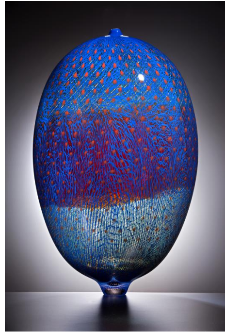
3. Lino Tagliapietra, Africa 2014, Lino Tagliapietra Collection