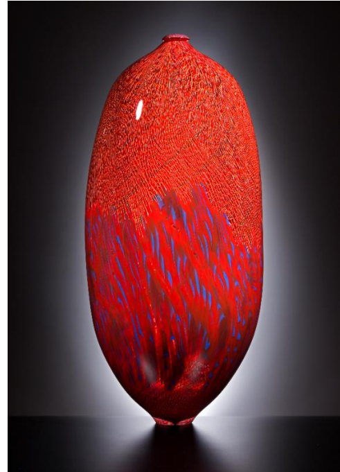
5. Lino Tagliapietra, Africa 2017, Lino Tagliapietra Collection