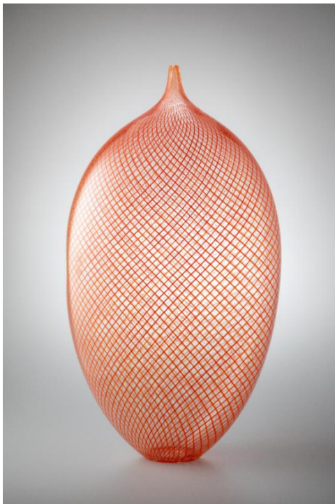
8. Lino Tagliapietra, Reticello 1999, Lino Tagliapietra Collection