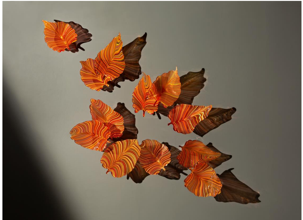
Lino Tagliapietra, Secret Garden , 2018, Lino Tagliapietra Collection

Period : October 12, 2019 – February 9, 2020