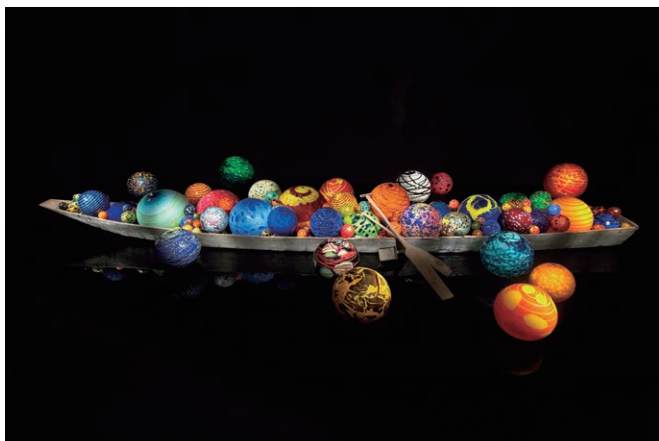
Dale Chihuly, Toyama Float Boat , 2015, H60xW917.5xD657.5cm, Toyama Glass Art Museum

Installations by the great master of contemporary glass art, Dale Chihuly, are in display. Five pieces from Chihuly's representative art series, such as the "Persian" and "Fiori" are in this exhibition.