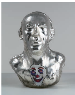
Erwin EISCH, Meanwhile My Mask Has Dropped , from the portrait head series "Picasso" 1997, Toyama Glass Art Museum