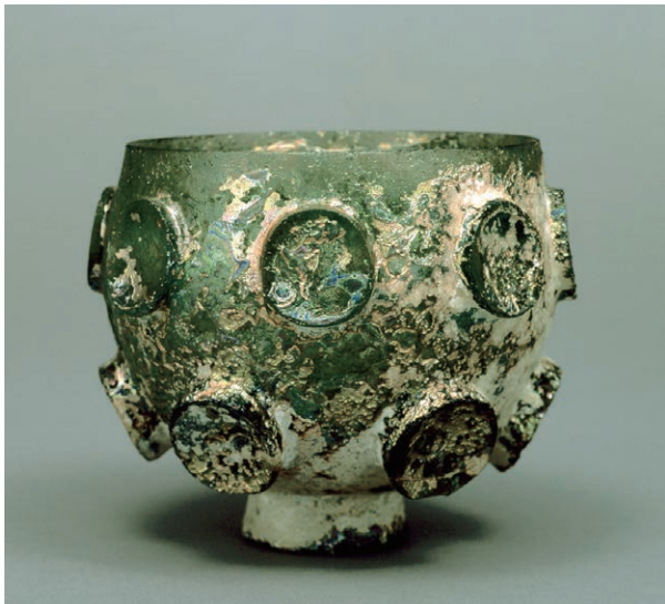
Bowl with Cut Relief Decoration, Iran, Sasanian Persia Dynasty, 5th-7th Century CE Collection of Hirayama Ikuo Silk Road Museum

Since ancient times, glass has fascinated everyone with its free forms, vivid colors, and glow. In this exhibition, approximately 350 glass masterpieces, the essence of the Silk Road collected by Hirayama Ikuo Silk Road Museum, are displayed, showcasing the history of glass extending for about 3,000 years from ancient Mesopotamia to the Islamic Period along with the amazing transcendental techniques. Moreover, about 40 paintings by HIRAYAMA Ikuo (Japanese painter of Nihonga style, 1930-2009) are shown along with his glass collection. Please enjoy the fantasy world of the Silk Road with the masterpieces of glass.