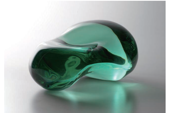
IEZUMI Toshio, F. 160201 , 2016, Collection of the artist

IEZUMI Toshio (1954- ) uses layered glass sheets and by shaving and polishing them depending on his own sense, he develops his unique formative expression. Thickness of the layered sheet glass and changing forms to be shaved give the work a tint of deep blue and richness in volume. Through transmission and reflection of light, the work mirrors the surrounding space in a mysterious way. This exhibition observes the world of Iezumi's unique works which he created tackling the material of sheet glass for about thirty years.