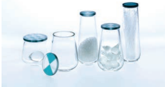
NISHIYAMA Yuki, Your Choice, Your Life , 2015 Toyama Glass Art Museum