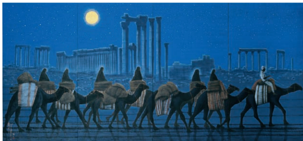
HIRAYAMA Ikuo, Ruins in the Moonlight, Palmyra , 2006 Collection of Hirayama Ikuo Silk Road Museum