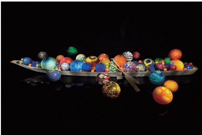
Dale Chihuly, Toyama Float Boat , 2015, H60xW917.5xD657.5cm, Toyama Glass Art Museum

Installations by the great master of contemporary glass art, Dale Chihuly, are in display. Five pieces from Chihuly's representative art series, such as the "Persian" and "Fiori" are in this exhibition.