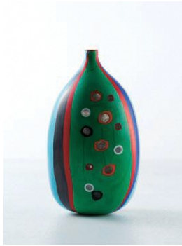
OHIRA Yoichi, Vaso a mosaico "Cerchi" 1996, Toyama Glass Art Museum