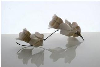
TOGASHI Youko, Harvest #7 2015, Toyama Glass Art Museum