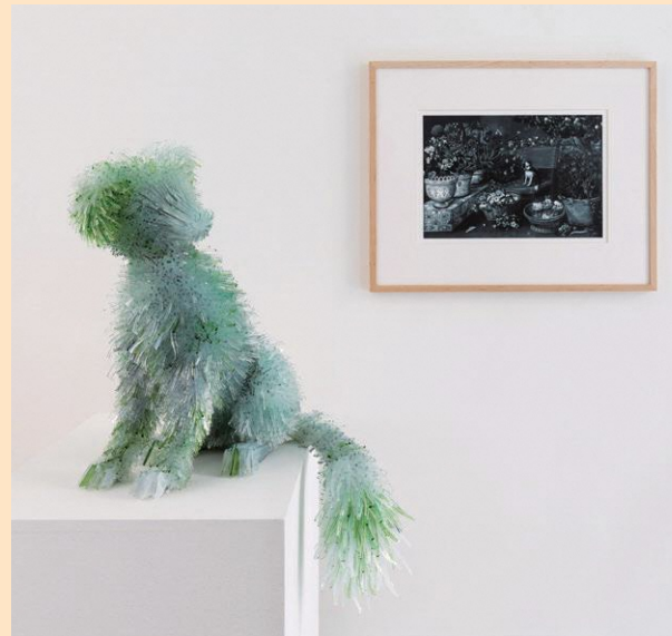
Marta Klonowska, Garden View with a Dog after Tomas Yepes, 2014 Toyama Glass Art Museum

This is the first solo exhibition of Polish artist Marta Klonowska in Japan. In the motifs of animals and shoes painted mainly in European paintings, her works are made of countless shards of colored glass combining different elements such as past and present, ideal and reality, and beauty and danger. They represent even emotions hidden deep in human beings. The charm of Klonowska's works, which stimulates the viewer's imagination, is presented.