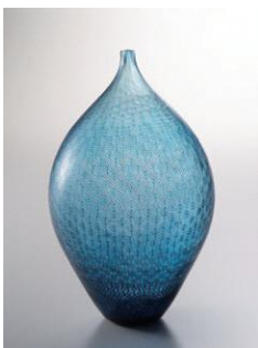
ENAMI Fujiko, Water , 2014 Toyama Glass Art Museum