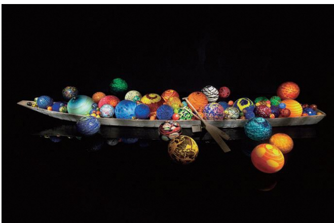
Dale Chihuly, Toyama Float Boat , 2015 H60xW917.5xD657.5cm, Toyama Glass Art Museum

Installations by the great master of contemporary glass art, Dale Chihuly, are in display. Five pieces from Chihuly's representative art series, such as the "Persian" and "Fiori" are in this exhibition.