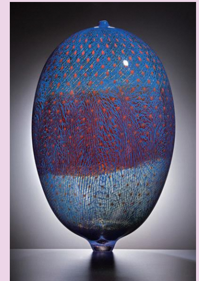
Lino Tagliapietra, Africa, 2014 Collection of Lino Tagliapietra Inc.

Lino Tagliapietra, the Maestro of Glass, was born in 1934 in Murano, Italy. Known for creative experimentation, Tagliapietra's prodigious technical skill has earned him international renown. Through innovative form and captivating color, Tagliapietra's artworks capture the spirit and vibrancy of the medium. The works in this exhibition span the Maestro's 70 year career, and demonstrate the Maestro's lifelong dedication to glass.