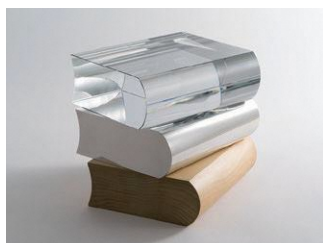
SUGASAWA Toshio, "Books on materials" in Book series, 1981 Toyama Glass Art Museum, Photo by SUEMASA Mareo