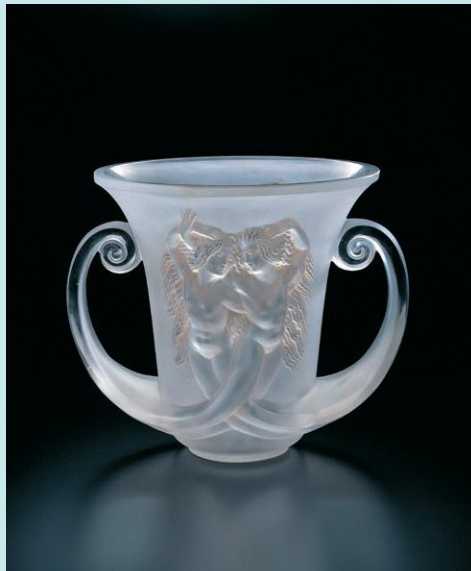
René Lalique, Vase Nadica, 1930 Kitazawa Museum of Art, Photo by Tetsuo Shimizu

René Lalique (1860-1945), who created Art Deco glass in the early 20th century, proposed a modern lifestyle by using glass in a wide range of fields such as perfume bottles and large-scale architectural decorations, which made life joyful. In this exhibition, we introduce Lalique's major works from his collection at Kitazawa Museum of Art.